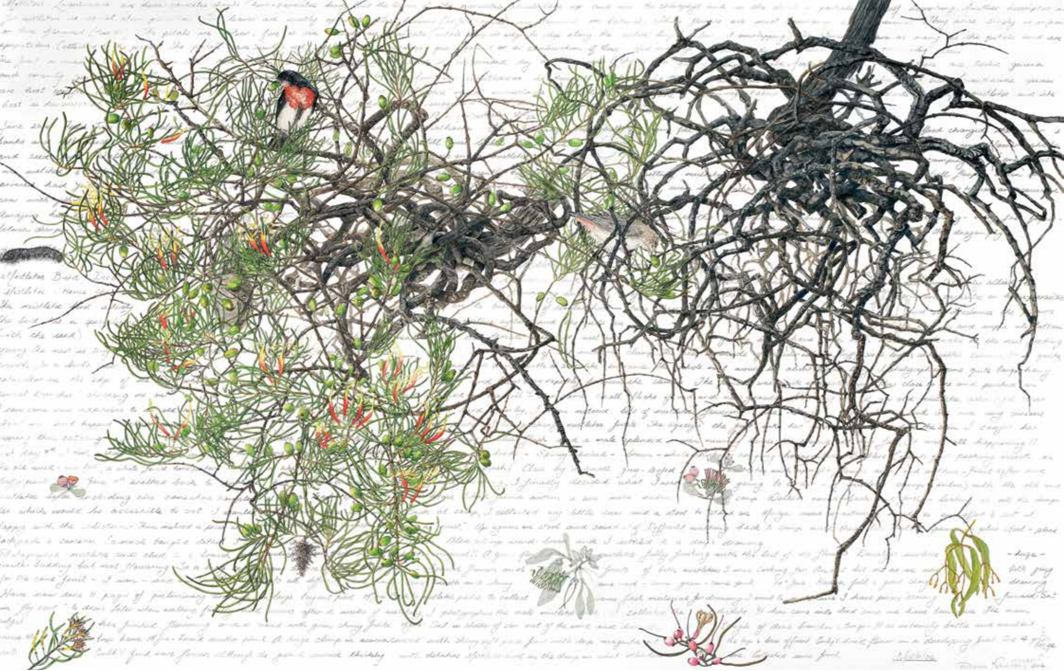
Mistletoe Bird, Bamboo Springs, Mulgool Station, 2014, pencil & watercolour on Arches hot press paper, 1m x 68cm