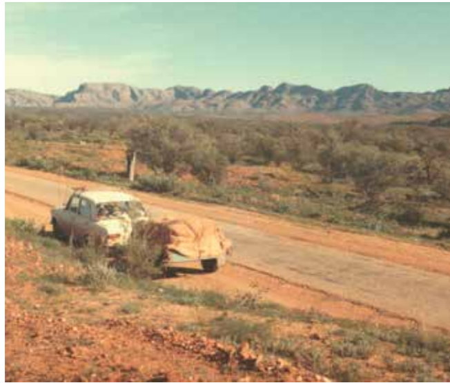
Around Australia trip in Fiat, 1973.

Say the trip's five weeks off, I think, 'Ah yep, plenty of time' – instead of doing the important things like getting packed and getting stuff together, I decide, 'Oh this project needed doing before we leave' so off come the wheels off the trailer and bearings get changed. 3