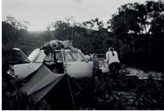
First field trip, 1970s.