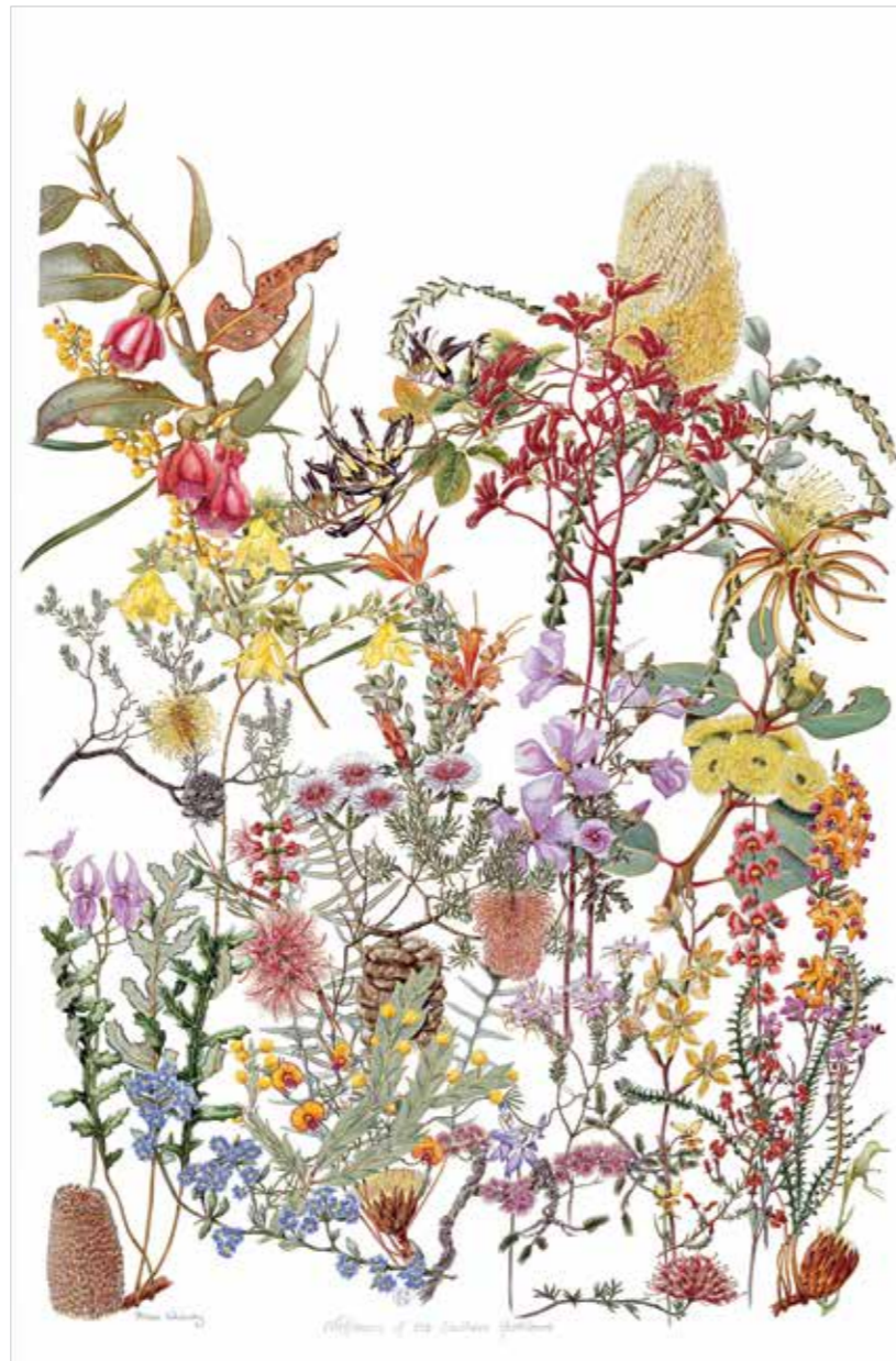
RIGHT Wildflowers of the Southern Heathland , 1990, watercolour, pencil & gouache on Arches hot press paper, 68cm x 1m