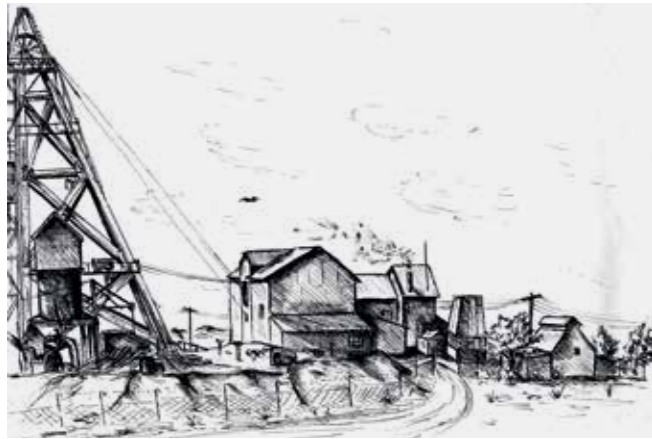
Philippa Nikulinsky, The Enterprise Mine , late 1950s, ink, 38cm x 28cm

to Hopetoun, 600 kilometres to the southeast of Perth, to photograph and collect specimens to paint for the magazine's cover artwork.