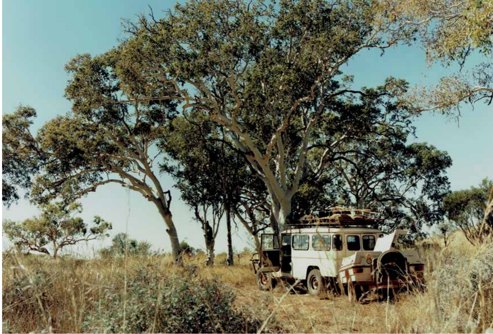
Out bush with LandCruiser at Rudall River, Great Sandy Desert, 1980s.